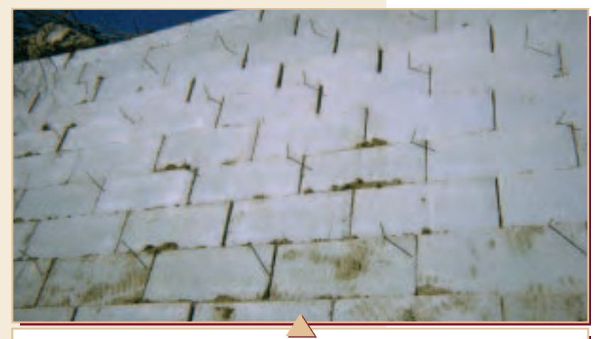
Straight face, unsplit KEYSTONE Standard units with a 9 gauge wire provided the surface and method for attaching the rock veneer.

View of top of wall elevation showing grouted cap serving two purposes: (1) seal off water (2) secure wire to units and provide clean surface for rock attachment.