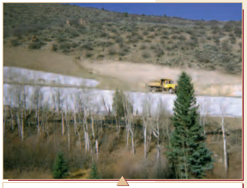
View of completed wall prior to placement of moss stone veneer.