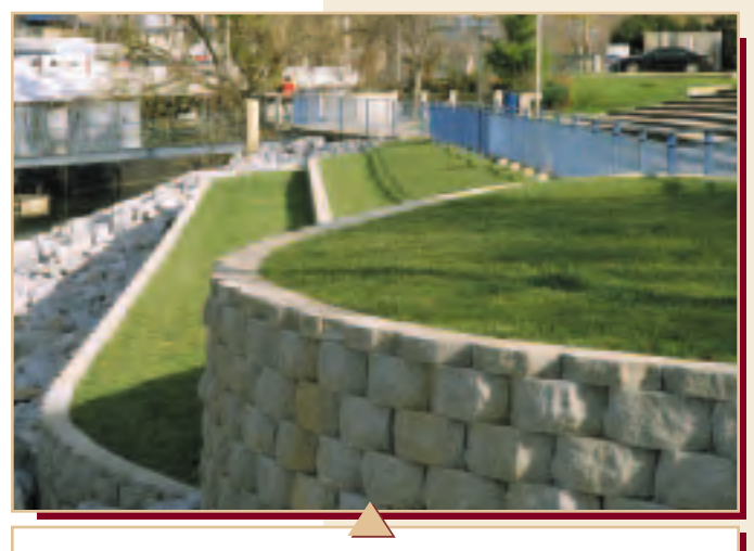
New Terrace wall protects amphitheater from erosion

Construction of the project began in the summer of 1998. The retaining walls were built by an experienced Keystone Systems installer, ABS Services of Jackson , Mississippi . After the lower terrace walls were completed, the system was put to the test with river flooding inundating the lower walls. Construction halted until the waters subsided, where examination found no